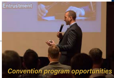
Convention program opportunities