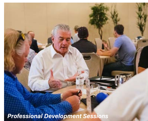
Professional Development Sessions