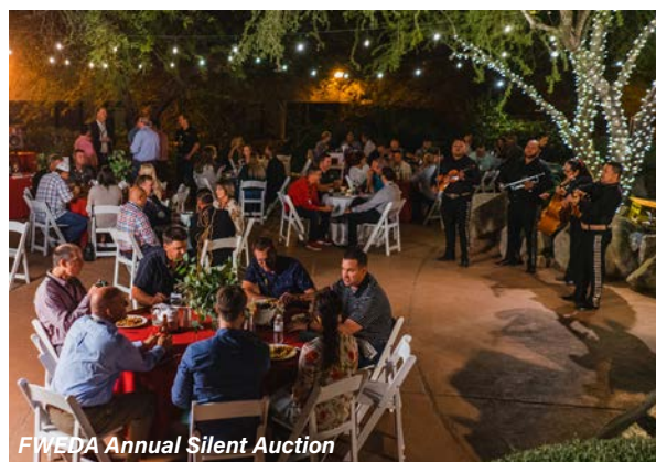
FWEDA Annual Silent Auction