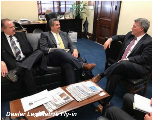
Dealer Legislative Fly-in